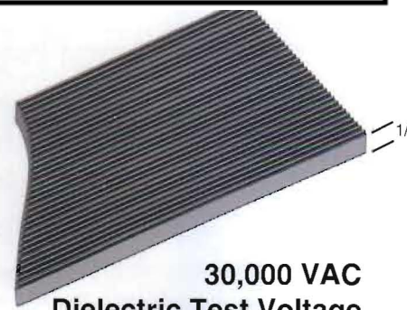
30,000 VAC Dielectric Test Voltage

CWF Flooring, Inc. www.CartwheelFactory.Com