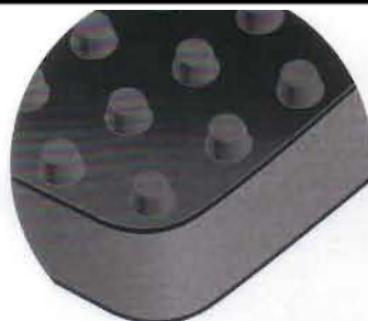
View of knobbed underside for use in wet environments

CWF Flooring, Inc. www.CartwheelFactory.Com