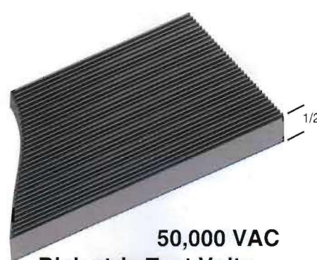
50,000 VAC Dielectric Test Voltage