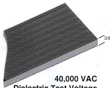
40,000 VAC Dielectric Test Voltage