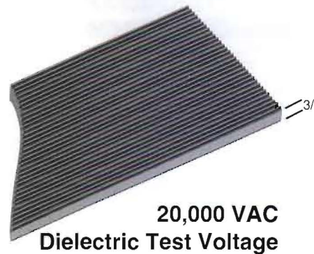
20,000 VAC Dielectric Test Voltage

CWF Flooring, Inc. www.CartwheelFactory.Com