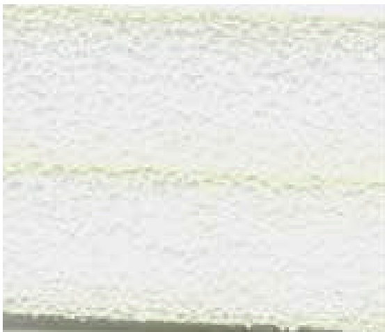
Cross-link polyethylene closed cell foam.