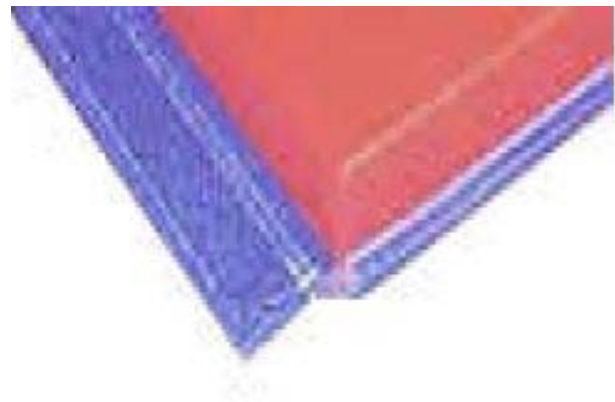
Mat corner showing Velcro® on edges