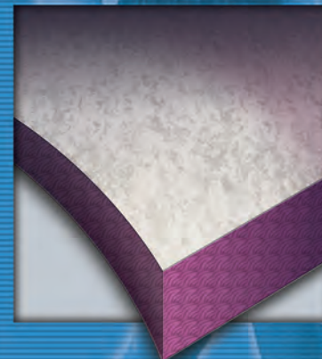
• Homogeneous PVC with non-slip urethane treatment