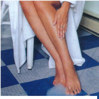
Anti-Slip RHINO tiles also come in a variety of attractive colors. (Shower room)