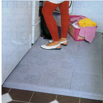
Tiles are practical for laundry rooms.